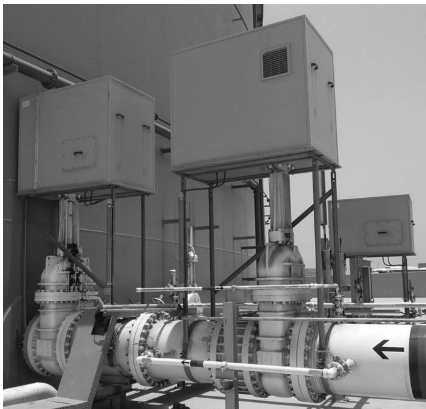
Figure 3 : Grp-based Fire Protection Enclosure For A Valve Actuation System.

type of collaborative approach to enclosure design, configuration and supply is becoming more common, as companies strive to reduce costs in their procurement processes.