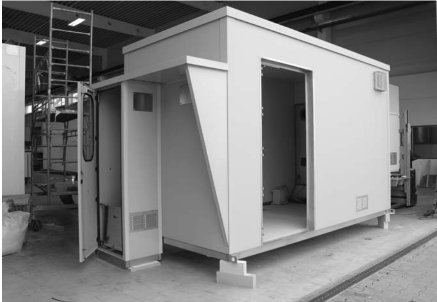
Figure 4 : This Analyser Containment Building Is Designed To Withstand Blast Loads As High As 300 Mbar This Image Will Be Provided Shortly.

enced by the same issues, such as weight, thermal insulation, corrosion resistance, etc. However, it is also likely to have to take into account factors such as fire resistance and possibly the need for antistatic precautions to prevent sparks being caused by electrostatic charging – the demand for explosion-proof equipment that meets the IEC 60079 standard for use in potentially explosive atmospheres is mandatory in many applications.