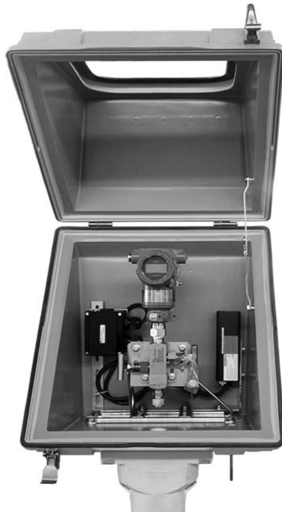
Figure 1: Intertec's Diabox Protective Enclosures Provide Easy Access For Maintenance.

Engineers tasked with choosing and configuring enclosures, cabinets and shelters for offshore applications face a multitude of conflicting demands. Not only must the unit provide protection against extreme cold or extreme heat – depending on platform location – but it must also be resistant to a host of environmental and other factors, such as salt spray, sour gas, high wind velocities, UV exposure and possibly high pressure blasts. Topping out this wish list, the enclosure needs to have a robust structural integrity, a very long service life and yet weigh as little as possible – as all topside weight on offshore platforms is an expensive commodity. Many of these demands are common to all types of protective enclosure, regardless of whether they are small instrumentation housings or relatively large shelters. This article looks at some of the issues behind each category.